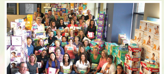
Delta Dental of Minnesota employees purchased over 23,000 diapers for the children at People Serving People, a homeless shelter in downtown Minneapolis.