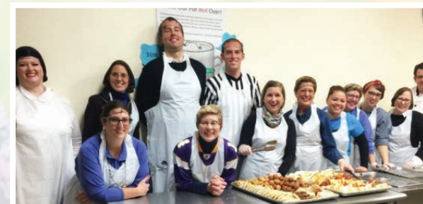
Delta Dental of Minnesota employees spent an afternoon serving lunch at the House of Charity in Minneapolis.

In addition to making grants and donations, our mission of improving the oral health of Minnesotans has been supported by the engagement and involvement of our employees. Our employees donated their time, goods, money, and talent to many flash philanthropy efforts throughout the year to support youth and families in need throughout the Twin Cities. We match employee contributions to many nonprofit organizations, doubling the impact, and further exemplifying our commitment to bettering the lives of Minnesotans.